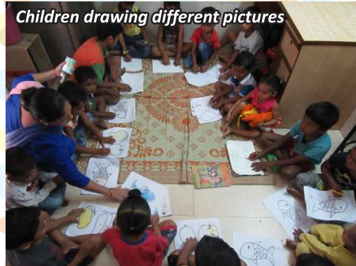
Children drawing different pictures