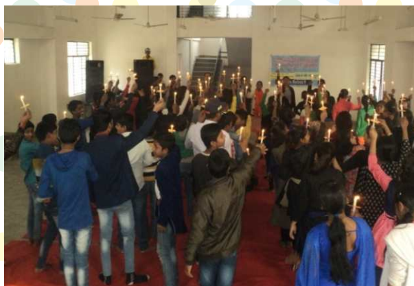
Youth Retreat at Malyvia Nagar, New Delhi