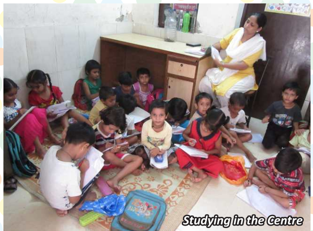
Studying in the Centre