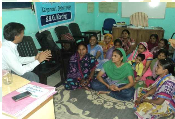
SHG meeting in Progress, Kalyanpuri, TF.