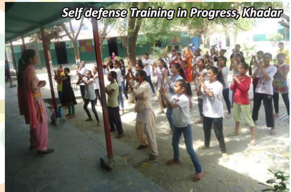
Self defense Training in Progress, Khadar

To strengthen the project staff and SHG leaders from urban slum project of Delhi, DC organized exposure visit to a reputed NGO at Dausa, Rajasthan. Empowered SHG leaders through field visit to 5 villages in Dausa block, Rajasthan, the group learned how to maintain the register and order of the meeting's proceedings and how to prepare washing powder, what are the ways of increasing their savings. Learned how SHG groups successfully saved more than Rs.1 Crore and influence with state government for social development and Entrepreneurship. The group was motivated after witnessing a gallant effort by group of women from remote villages from dry lands without water, transport and culturally oppressed women in Rajasthan