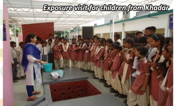
Exposure visit for children from Khadar