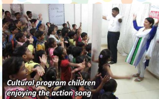
Cultural program children enjoying the action song