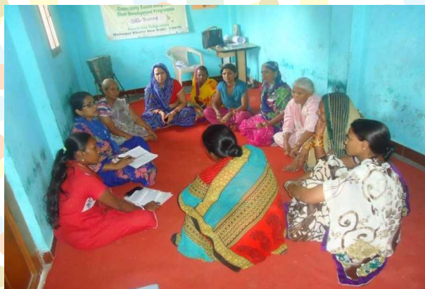
SHG Training in Progress (Khadar)