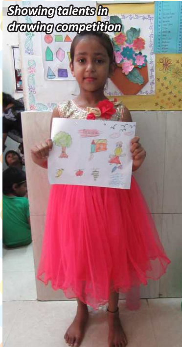
Showing talents in drawing competition