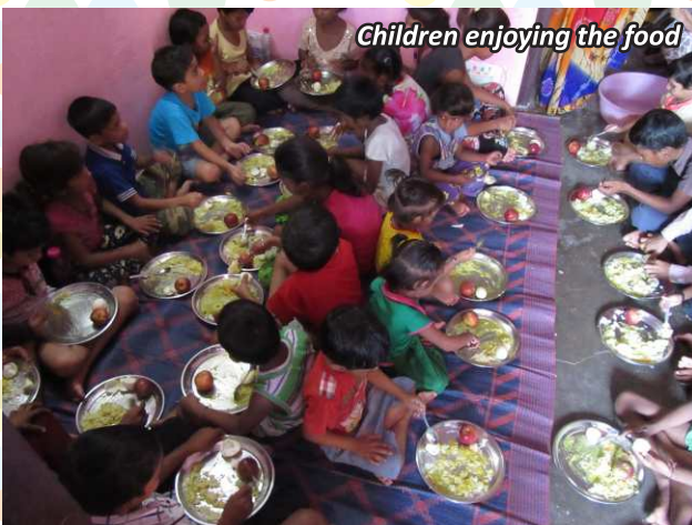
Children enjoying the food

Some of the activities of the children are shown as below:-