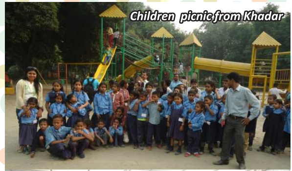
Children picnic from Khadar