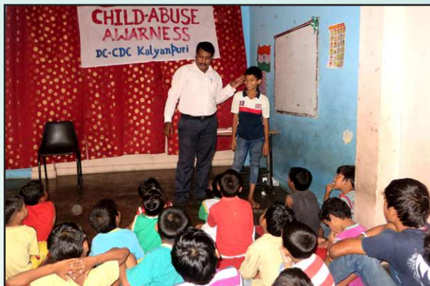
Awareness on Career guidance and Child abuse at Kalyanpuri