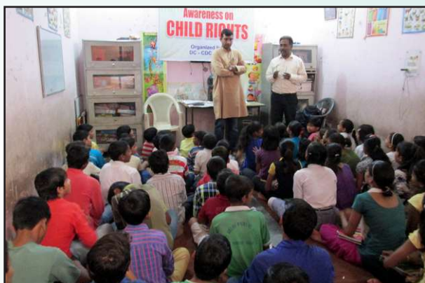
Awareness on child rights at Ghaziabad