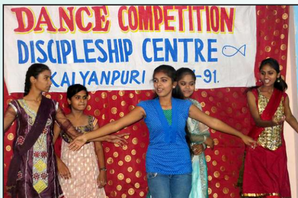
Dance competition at Kalyanpuri