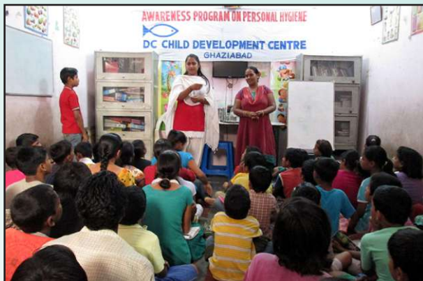
Awareness on HIV/AIDS and personal hygiene at Ghaziabad