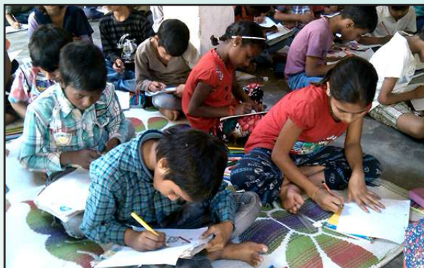
Mother's day celebration and drawing competition at Palwal