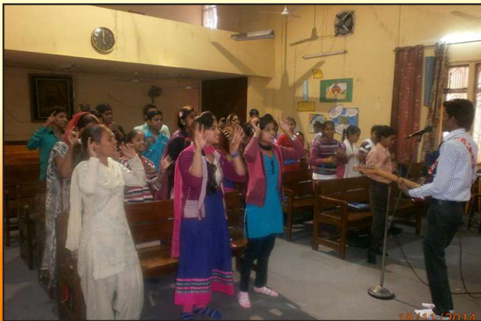
Seekers Camp at Faridabad

We thank our donors, Happy Tree Missionary work, Hong Kong and Compassion International.