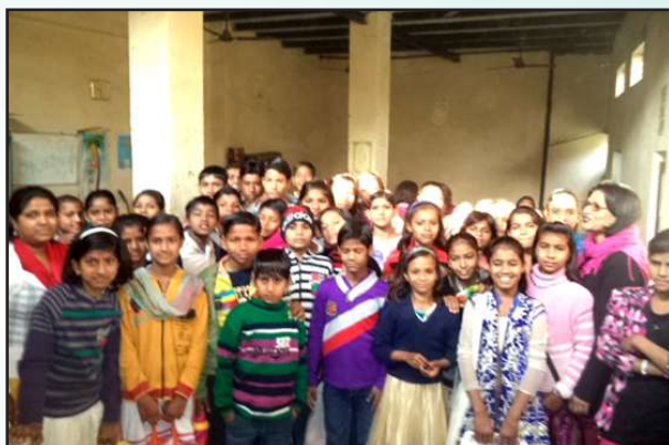
Awareness on child abuse and Field trip at Faridabad