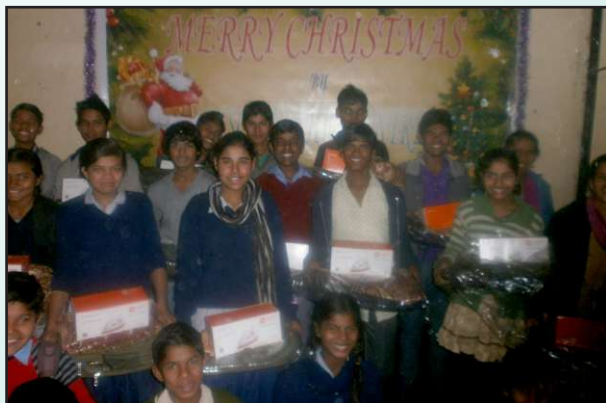
Christmas Celebration at Faridabad