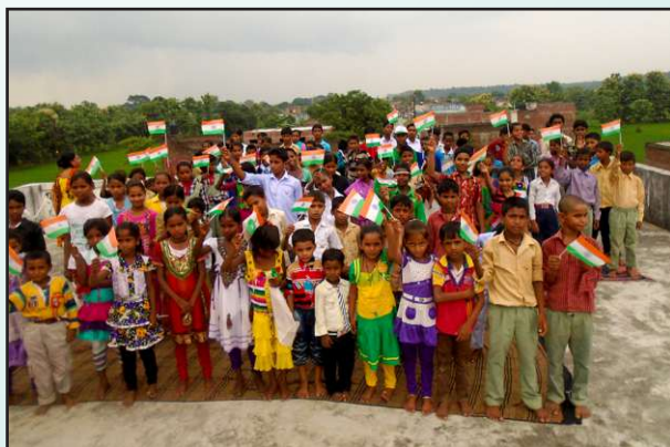
VBS program and Independence program at Gorakhpur