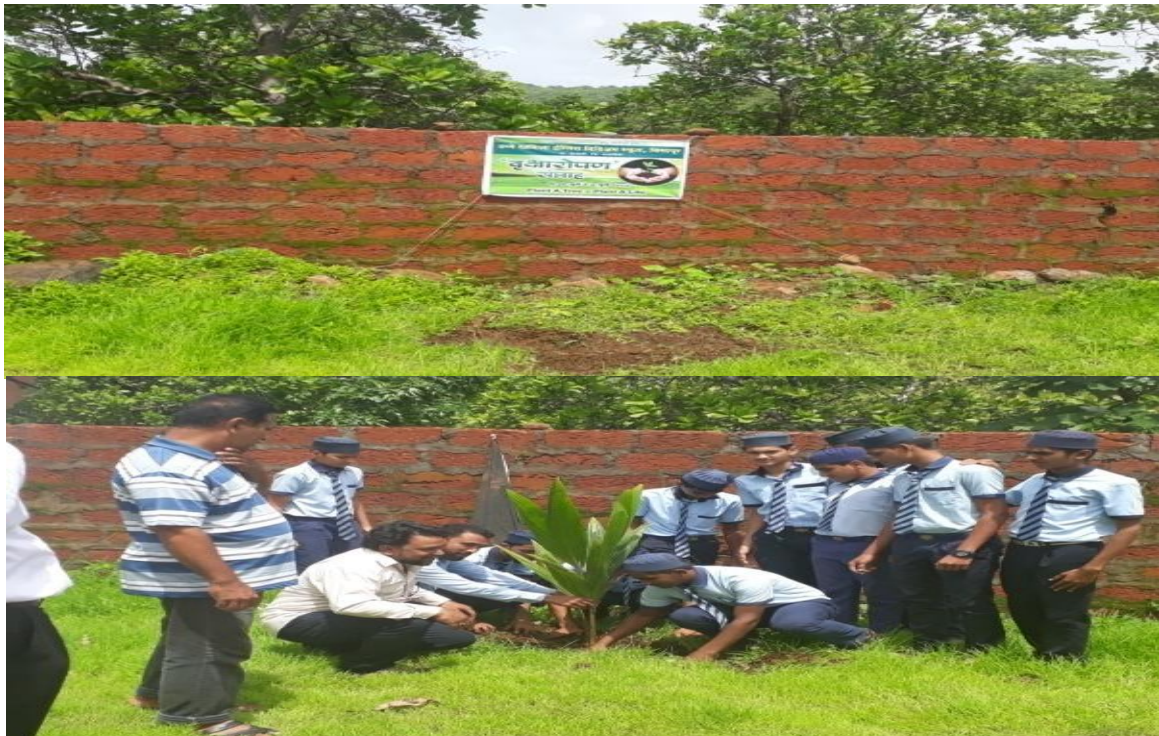
Pics: Students are planting trees