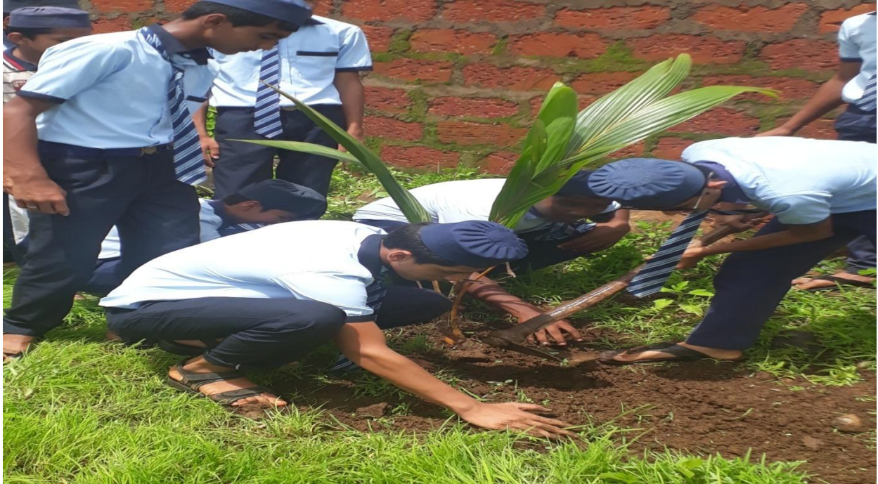
Pic: Students are planting trees on world Environment Day.