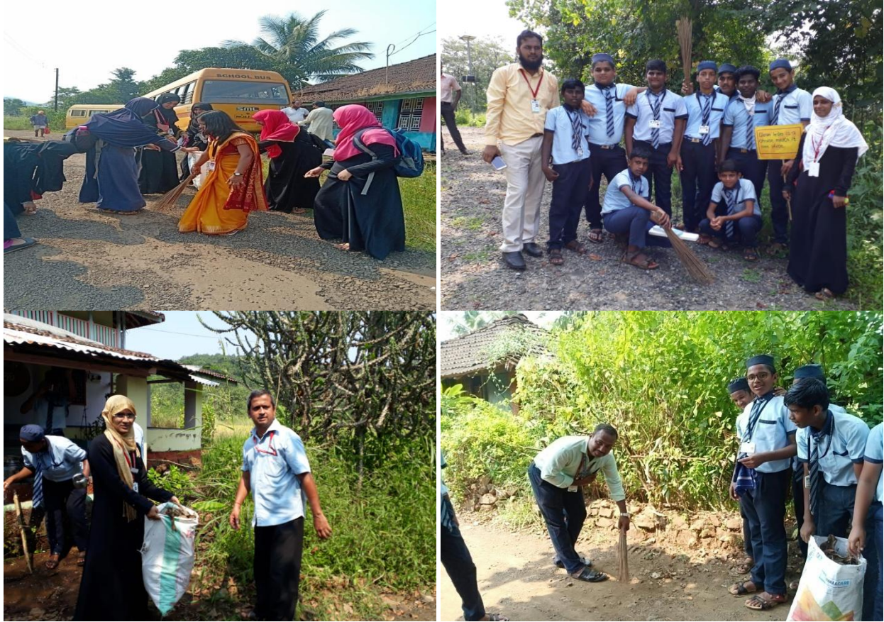
Pic: Teachers and students are cleaning garbage at Valote Village