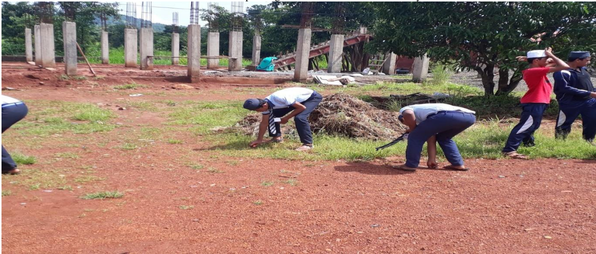
Pic: Students are Cleaning Campus.