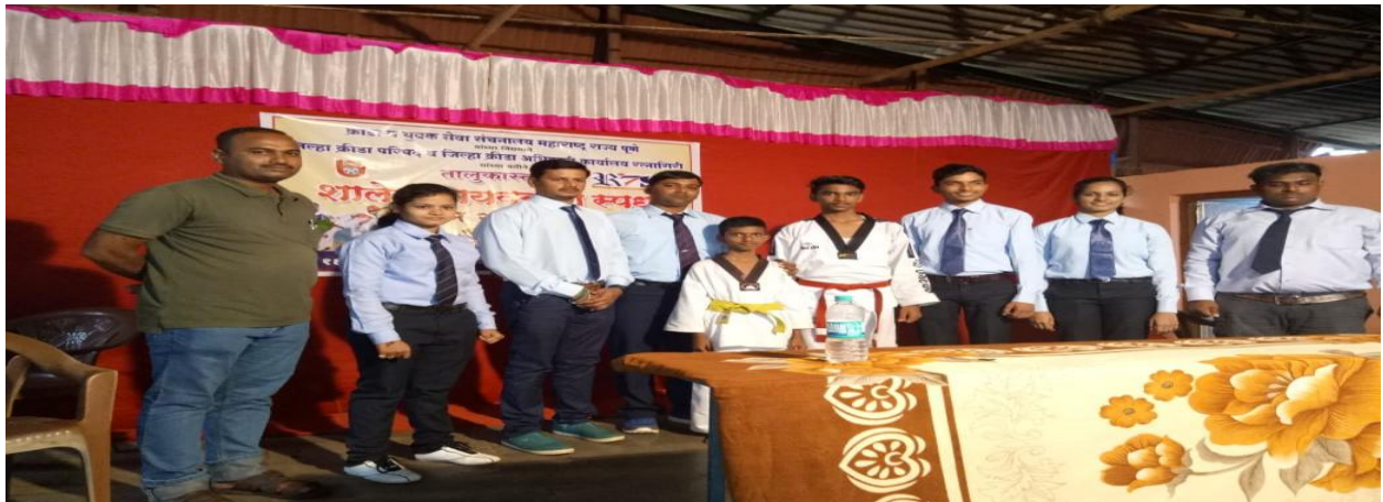
Pic: Prize Distribution programme for Taluka Level Taekwondo Competition

The discipline of Taekwondo leads to increase energy, better health and fitness, greater coordination, and higher self- esteem. These qualities are vital to a happier, long life.