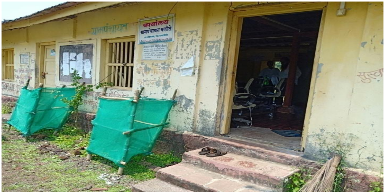
Pic: Low cost as well as eco friendly Dustbins are prepared by our students that fixed in premises of Gramanchayat Volate.