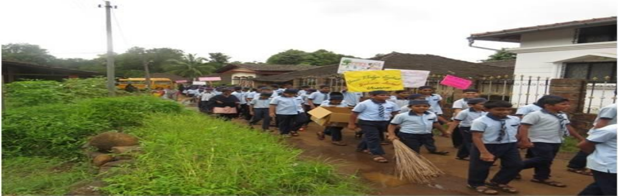
Pic: Rally in Visapur Village