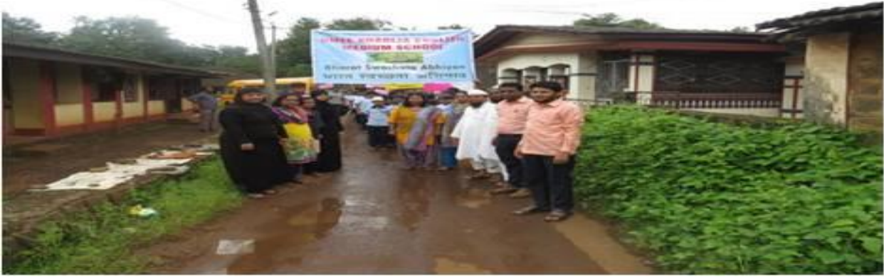
Pic: Rally in Visapur Village in presence of Principal, Teaching Staff and PTA members of Visapur.