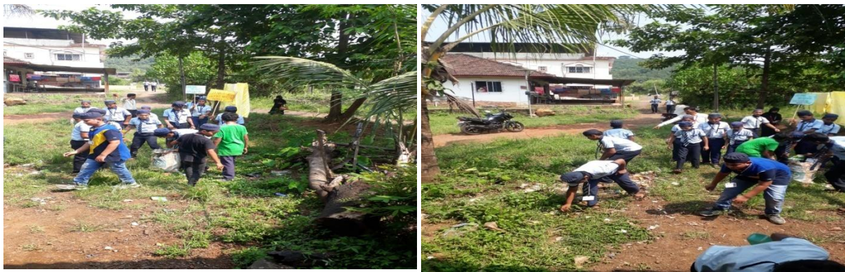
Pics: Students are cleaning village garbage during Swachta Abhiyan.