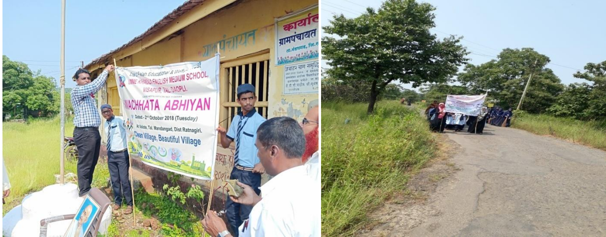
Pics: Principal, Vice Principal and Teaching staff along with PTA members and People of Gram Panchayat Valote Village gathered for celebration of Swachta Abhiyan