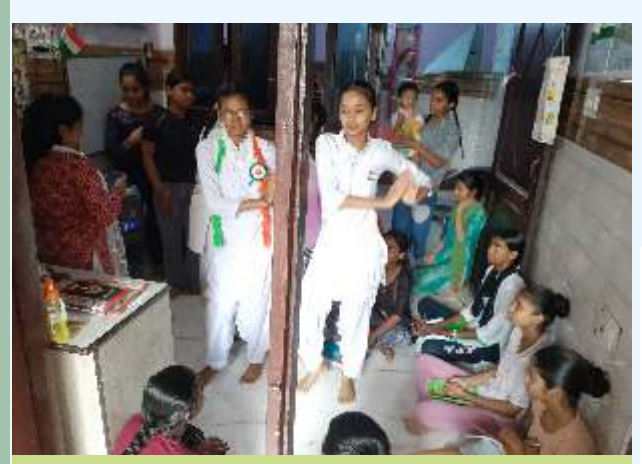
Independence Day celebration