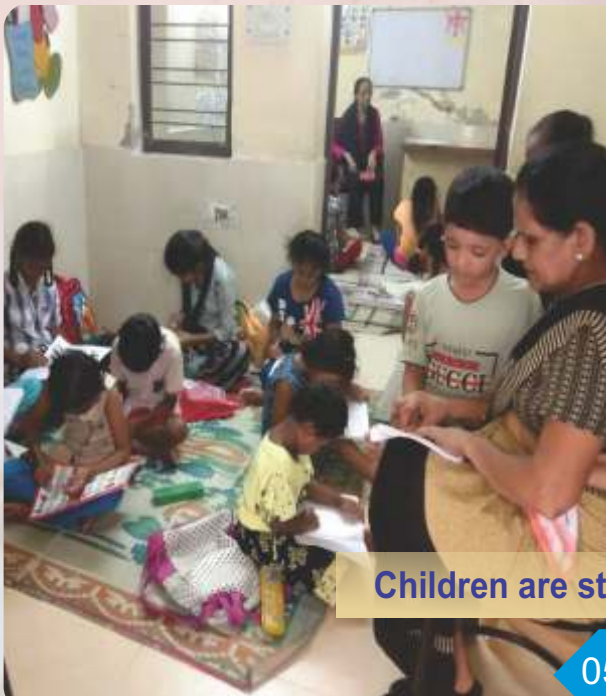
Children are studying our Centre