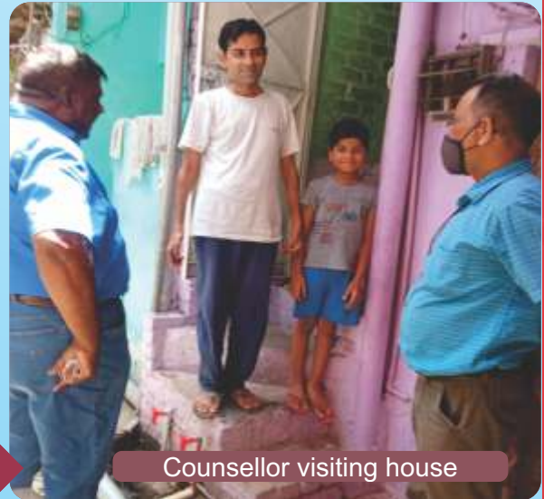
Counsellor visiting house