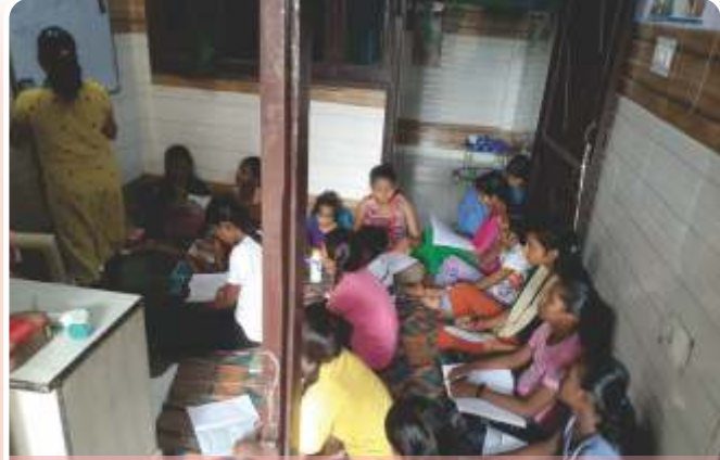
Children at Madanpur Khadar

After Covid -19 the schools are opened and our children from the Centre are going to school regularly. Our Centre teachers are dedicated to teach the children on regular time and whenever they need.