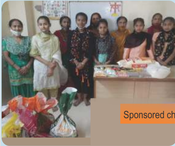
Sponsored children with dry ration

He is an amazing person and is individually sponsoring 48 children of DC in different parts of Delhi. Even though in his difficult time he doesn't forget his sponsored children in the pandemic period. He regularly met their needs. Distribution of dry ration helped the children and family in this crucial period of Covid – 19.