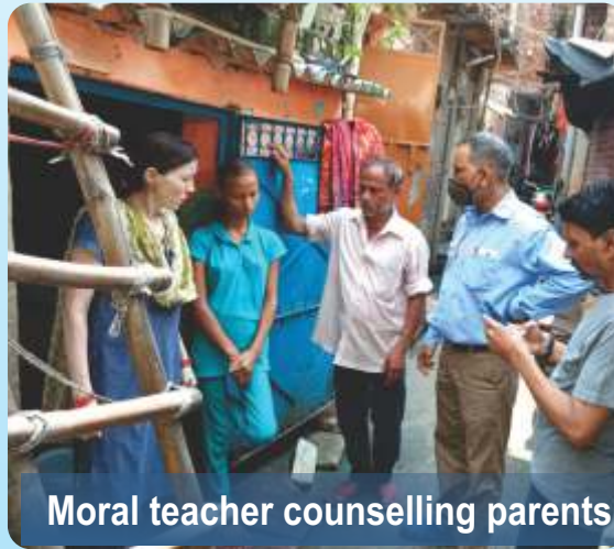
Moral teacher counselling parents

Now children are slowly coming to their normal self. The adolscent girls are specially counselled by their teacher.