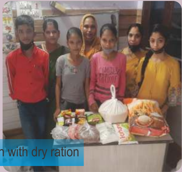
Sponsored children with dry ration